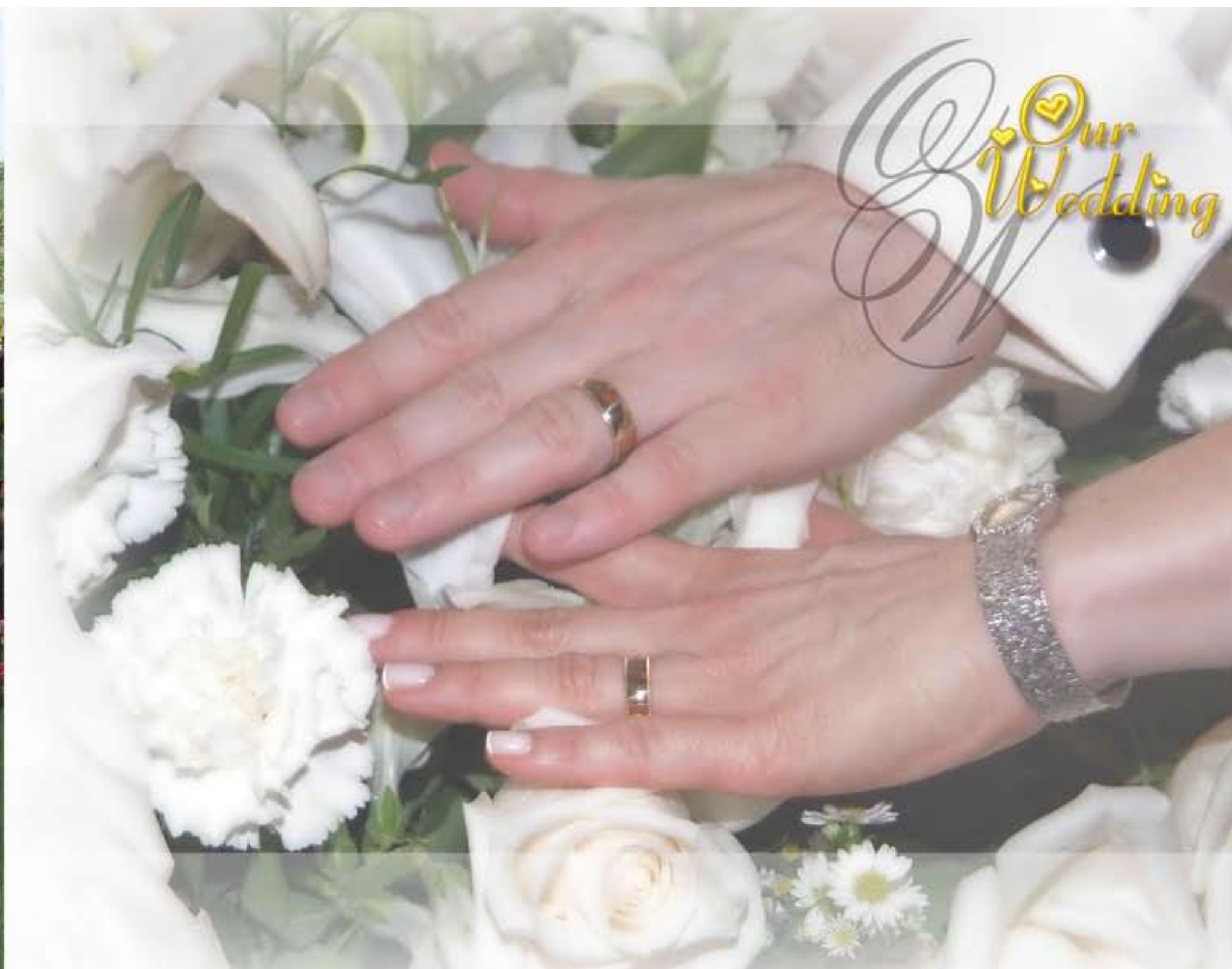
Yves Paris_001.jpg Exposure: 1/125 sec at f/16